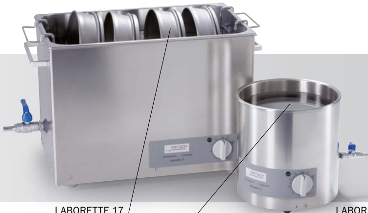
LABORETTE 17 Size II