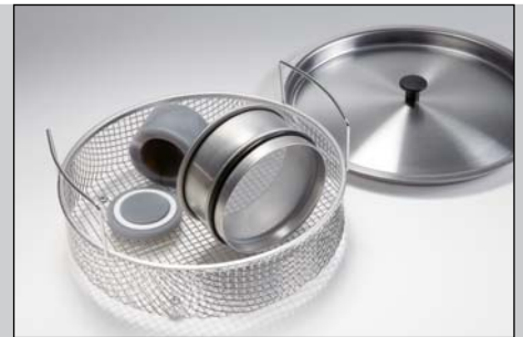
LABORETTE 17 Size I

Simple operation to clean the sieves, they are simply placed or positioned in the cleaning liquid.