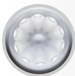
Dividing head 1:10