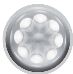
Dividing head 1:8